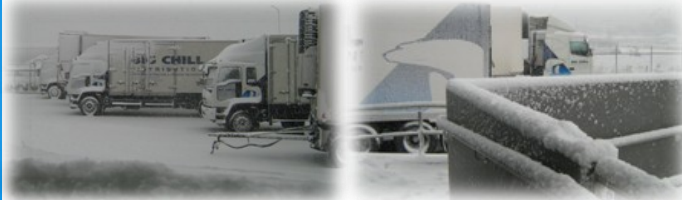
Snow in Christchurch during July/August 2011