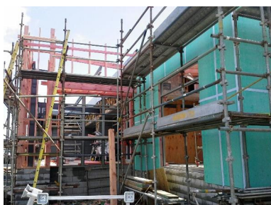
Left: board room and lunch room construction, Right: new office construction