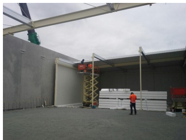
Left: freezer under-slab pour 9th Oct, Right: insulation installation